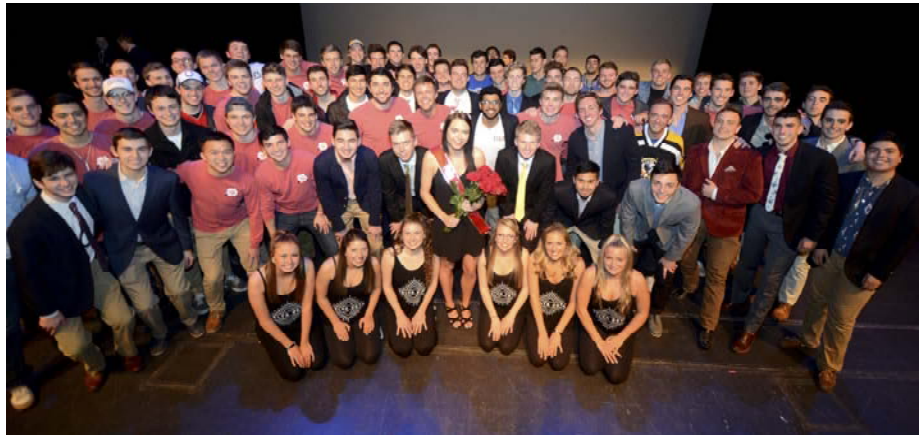
The brothers pose with the 2017 Rose Queen and her court at the conclusion of the War of Roses talent show.

The War of Roses programming raised nearly $6,300 toward the chapter's annual Ability Experience fundraising. From the proceeds, the chapter will also be donating $250 to The Starkey Hearing Foundation, Delta Zeta's philanthropy.