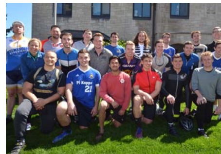
2017 Pi Kapp 100 team photo

In all, more than 250 people participated in the 2017 Pi Kappa Phi Moms Day.