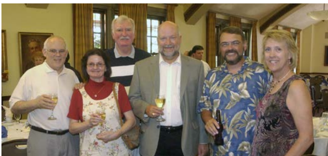
Photos from the 85th and 90th chapter anniversary celebration banquets.